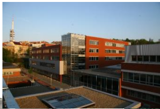
Main Campus Prague, Žižkov