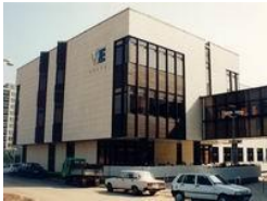
Campus Prague, Jižní Město