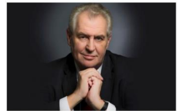
Miloš ZEMAN President of the Czech Republic