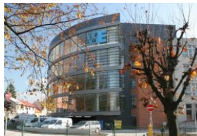
Campus Jindřichův Hradec, South Bohemia